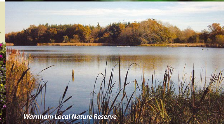
Warnham Local Nature Reserve