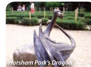
Horsham Park's Dragon

Horsham is a family-friendly town with charming, pedestrianised streets and plenty of entertainment on offer. The town boasts a regular free event programme throughout the year as well as free bandstand concerts and fun sessions for toddlers throughout the summer. Family shows and blockbuster movies are on offer at The Capitol, North Street whilst popular exhibitions and hands-on fun can be found at Horsham Museum & Art Gallery.