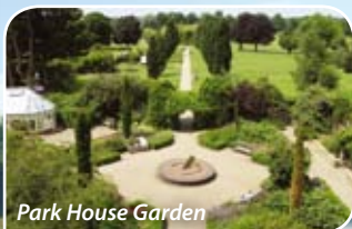
Park House Garden

On the southern boundary of the town lies Chesworth Farm . This 90 acre farm contains meadowland, hedgerows, pond and riverside.