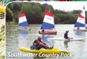
Southwater Country Park