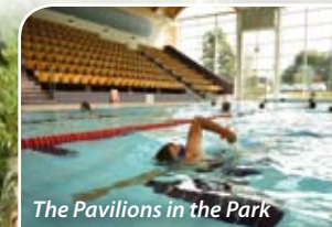
The Pavilions in the Park

With much of the town pedestrianised getting about is easy. For those with mobility difficulties, a Shopmobility facility operates from the second floor of Swan Walk Shopping Centre car park. Please book in advance: Tel: 01403 249015