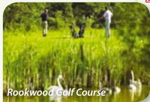
Rookwood Golf Course